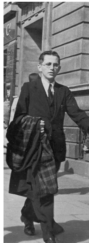
On his way to enter Novitiate 1941 in Ireland

In September of 1949 he was sent from Ireland to serve at St. Joseph Church in Roseburg, OR as associate pastor. He then served as associate pastor at St. Mary's in Ukiah, CA and Our Lady of Angels in Hermiston, OR, 1952-54. Afterward he served as Pastor at St. Aloysius in Point Arena, CA; Our Lady of Good Counsel in Fort Bragg, CA; St. Mary's in Ukiah, CA; Our Lady of Angels in Burlingame, CA; and St. Joseph in Roseburg, OR in 1974.