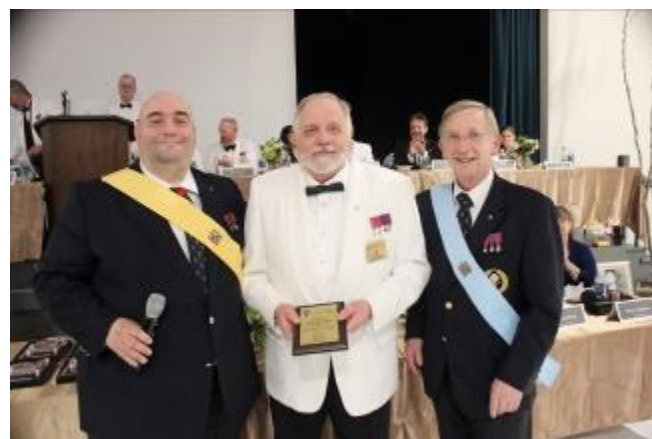
Assembly of the Year Award Assembly 3248