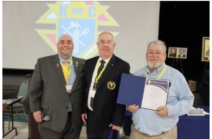
Assembly 3248 Sherwood