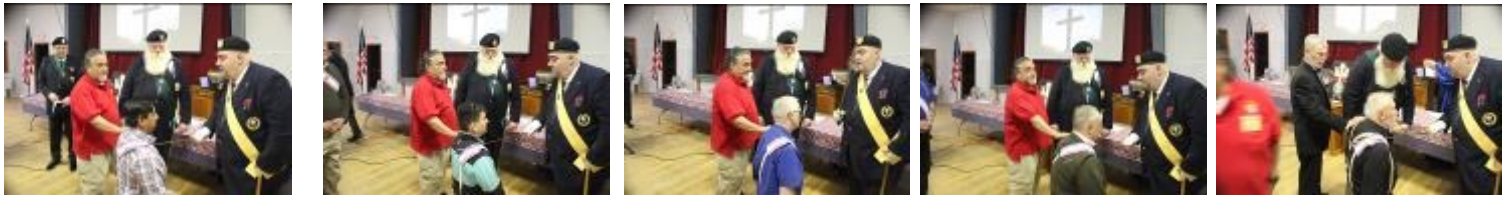
Welcome to our newest Sir Knights!