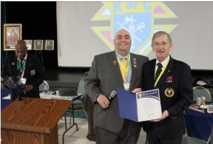
Assembly 905 Medford