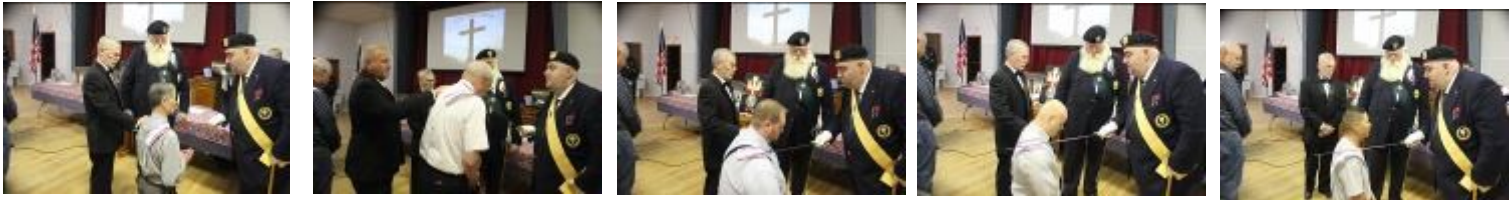
Patriotic Degree In Hermiston April 20th

On the night before the start of the Convention, Hermiston put on an exemplification at their parish hall. Several individuals went through the CUF degrees and then after a short break that Fourth Degree Exemplification was completed. Many thanks to the degree teams for making this possible.