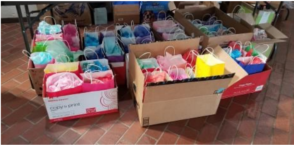
Mother's Day bags to be distributed to the unwed mothers' homes.