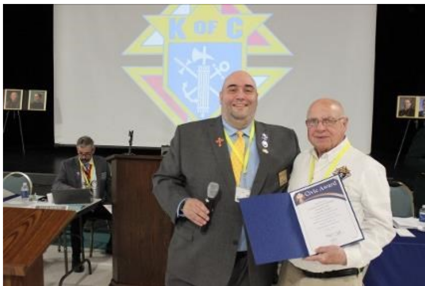
Assembly 1995 Coos Bay