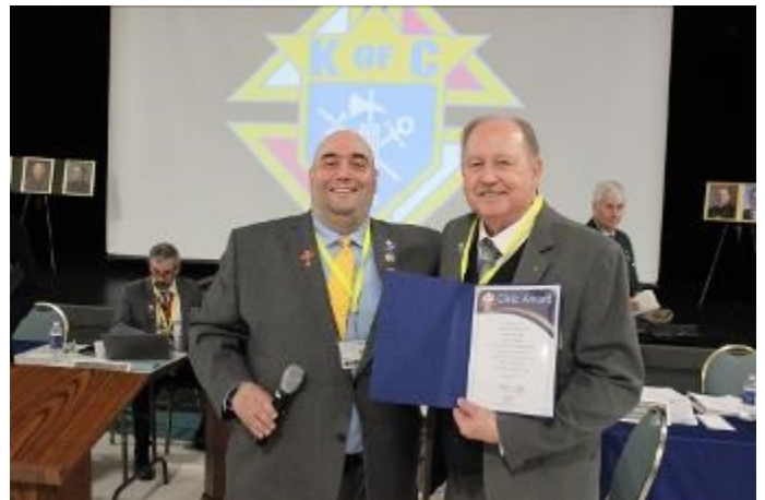
Assembly 908 Bend