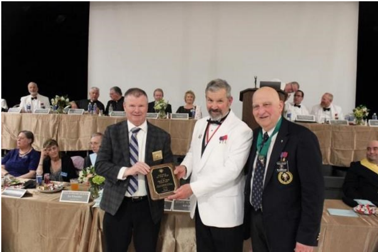
Council of the Year Council 9257 Milwaukie