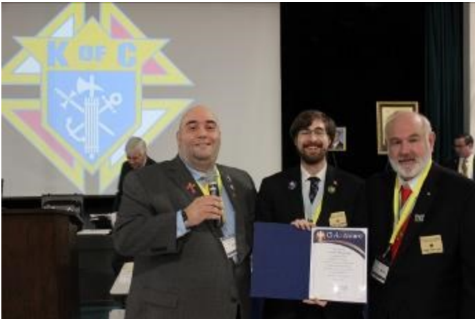
Assembly 3219 Beaverton