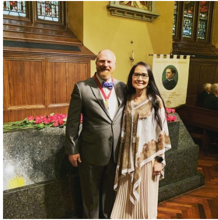
Outgoing State Deputy Fraternal Year 2018-2019 Sitting in "The Oregon Pew"