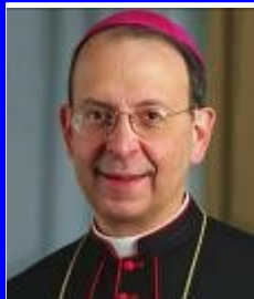
Supreme Chaplain Archbishop William E. Lori