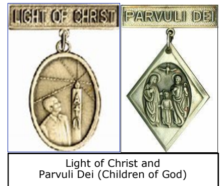
Light of Christ and Parvuli Dei (Children of God)

I remember so vividly, the Scout Mass was my first exposure to the Knights of Columbus when I received my Light of Christ emblem 17 years ago. I was very impressed by the Knights of Columbus in their capes and swords that I then aspired to become a Knight someday. Now I find myself, 17 years later, as having the opportunity to stand where I aspired to be all those years ago and provided that same inspiration to today's youth in the same way. Several youth came up to me and said they wanted to become a Knight and get the sword when they became of age. I showed them my scout uniform with my own Light of Christ and Parvuli Dei emblems.