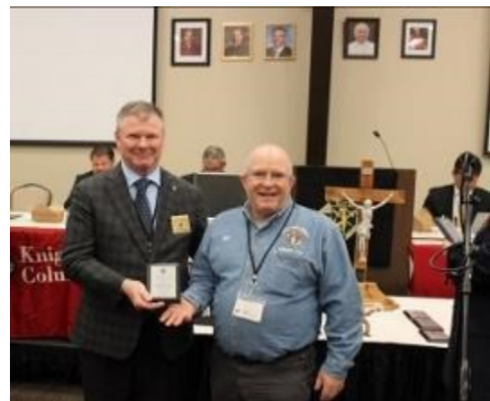
Family Activity Award Division 3 Honorable Mention Council 17396 Bandon