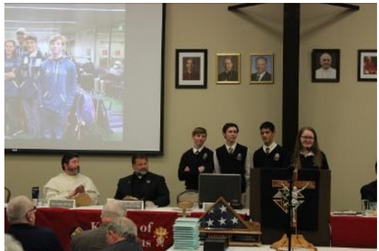
Youth group giving an inspirations talk during Saturday morning events