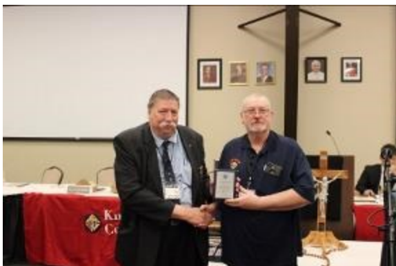
Community Activity Award Division 2 Council 3179 Gresham