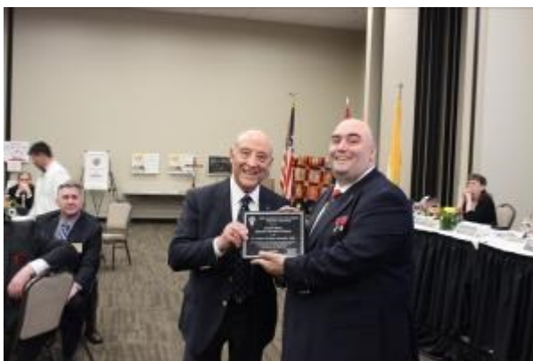
Carroll Gorg Patriotic Excellence Award Assembly 1606 Canby