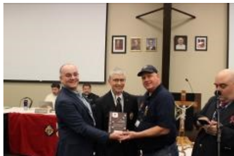
Faith In Action Faith Award Council 1634 Hillsboro