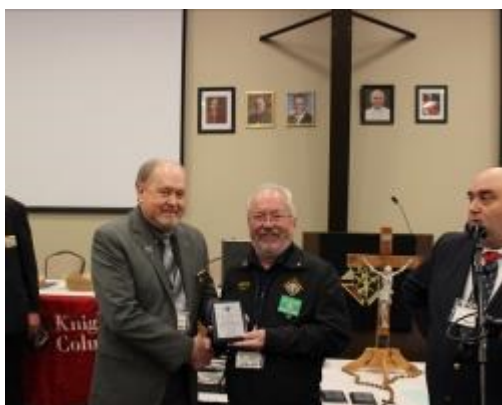
Community Activity Award Division 2 Council 9137 Sherwood