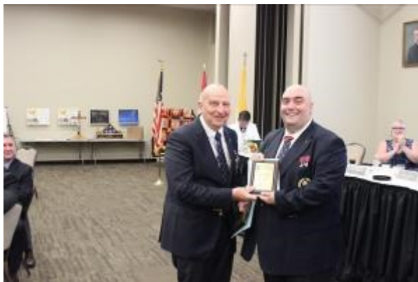
Assembly of the Year Assembly 2251 Milwaukie