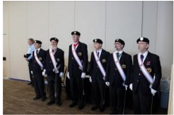
Honor Guard after Sunday morning Mass