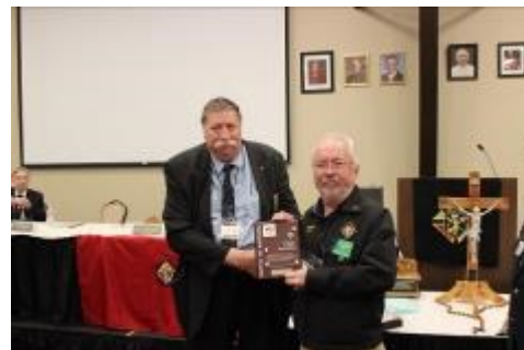
Faith In Action Life Award Council 9137 Sherwood