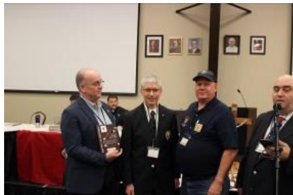
Supreme Faith Activity Award Council 1634 Hillsboro