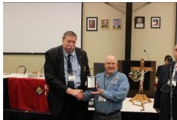
Life Activity Award Division 3 Honorable Mention Council 17396 Bandon