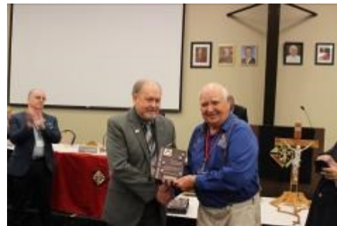
Faith In Action Community Award Council 3484 Canby