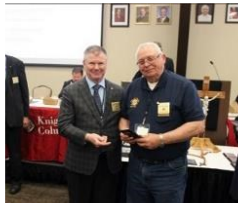
Family Activity Award Division 2 Honorable Mention Council 8129 Dallas