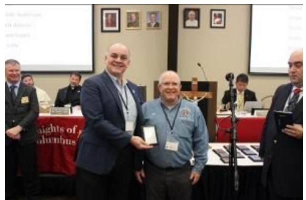
Faith Activity Award Division 3 Honorable Mention Council 17396 Bandon