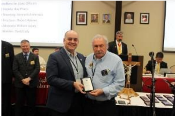
Faith Activity Award Division 1 Council 1623 McMinnville