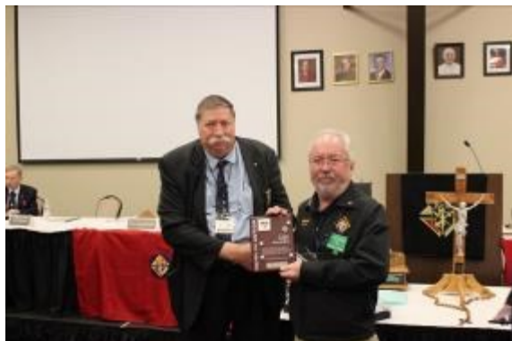
Supreme Life Activity Award Council 9147 Sherwood