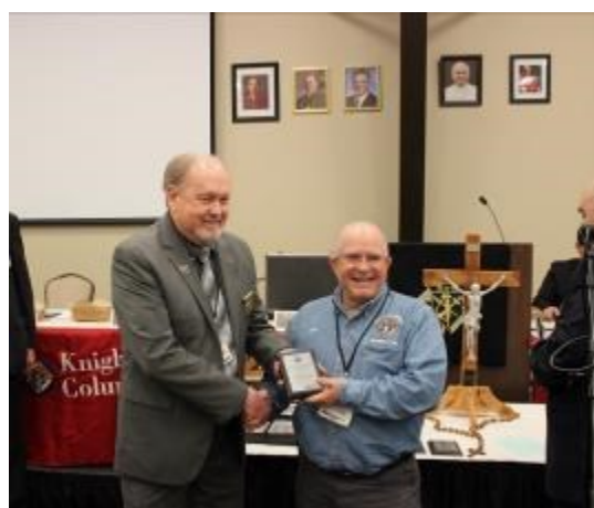
Community Activity Award Division 3 Honorable Mention Council 17396 Bandon