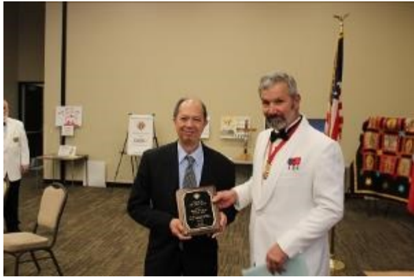
Council of the Year Council 9257 Milwaukie