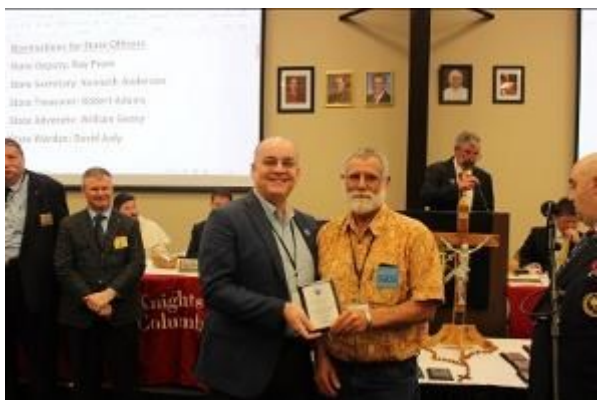
Faith Activity Award Division 3 Council 15773 Florence