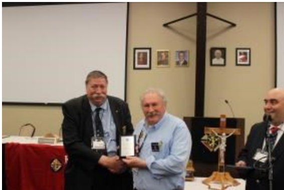
Life Activity Award Division 1 Council 12656 Portland Cedar Mills