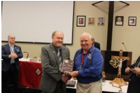
Supreme Community Activity Award Council 3484 Canby