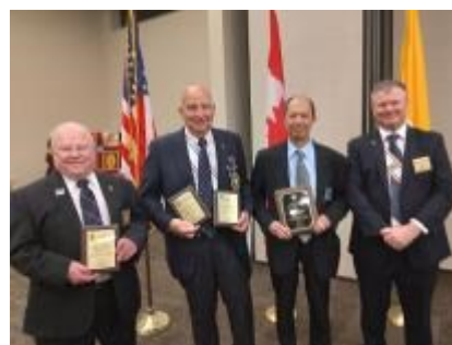
Supreme Awards L-R Canby Council 3484 Hillsboro Council 1634 Hillsboro Council 1634 Sherwood Council 9137