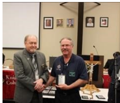
Community Activity Award Division 2 Honorable Mention Council 3509 Molalla