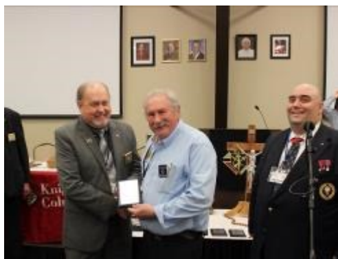
Community Activity Award Division 1 Council 12656 Portland Cedar Mills