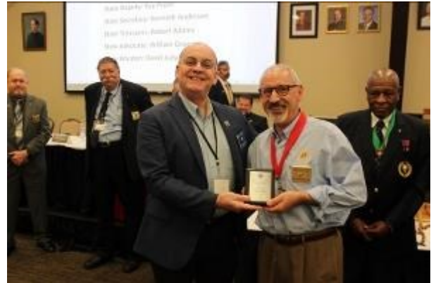
Faith Activity Award Division 1 Honorable Mention Council 1623 McMinnville