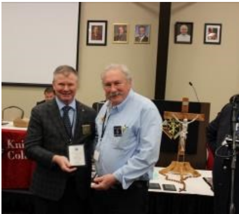
Family Activity Award Division 1 Council 12636 Portland Cedar Mills