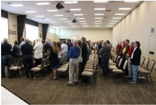
State of the State speech and Necrology Mass