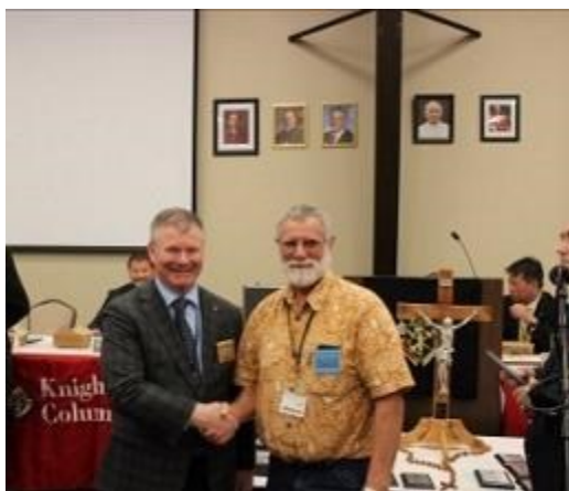
Family Activity Award Division 3 Council 15774 Florence