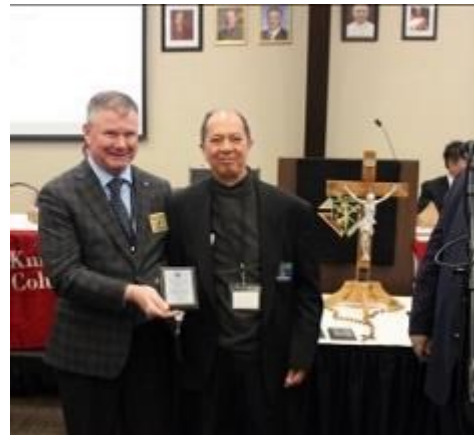
Family Activity Award Division 1 Honorable Mention Council 9257 Milwaukie