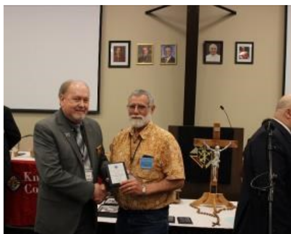
Community Activity Award Division 3 Council 15773