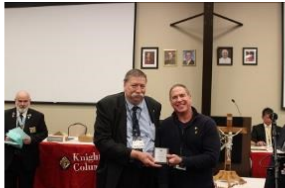
Life Activity Award Division 1 Honorable Mention Council 1623 McMinnville