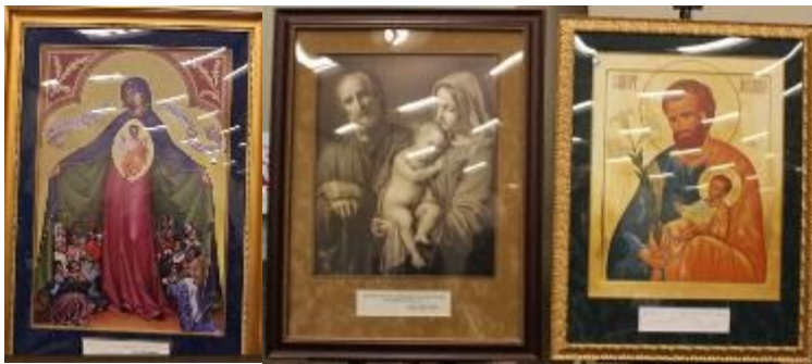
Icons displayed during the Convention