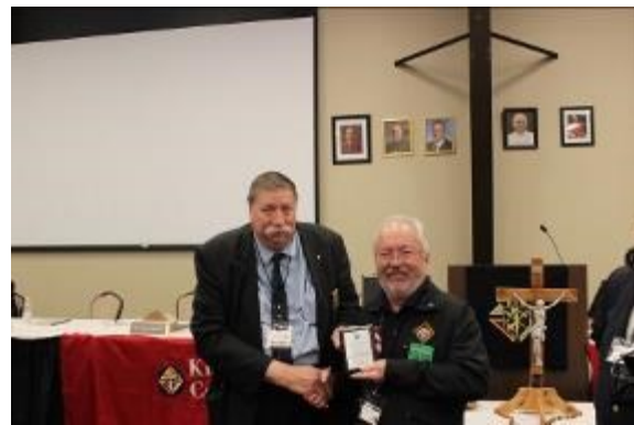
Life Activity Award Division 2 Honorable Mention Council 9137 Sherwood