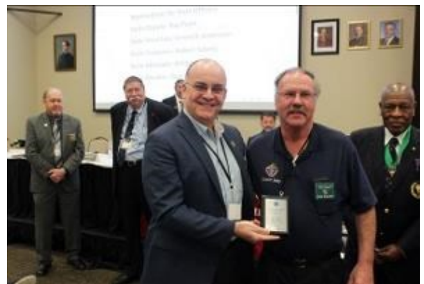
Faith Activity Award Division 2 Honorable Mention Council 3509 Molalla