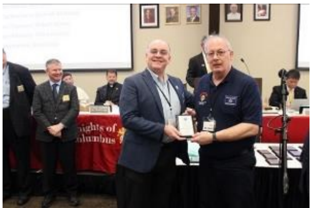
Faith Activity Award Division 2 Council 14802 Beaverton