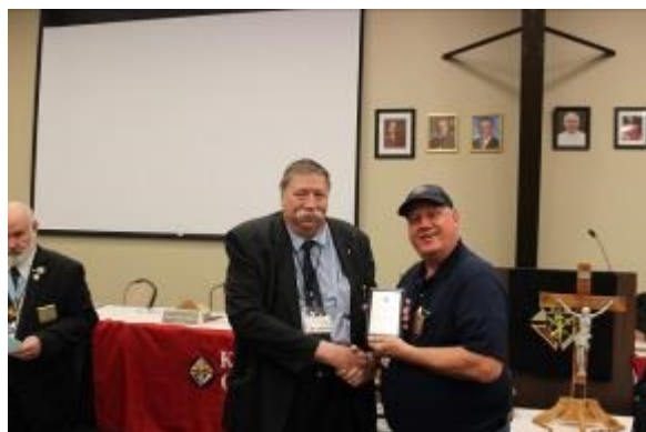
Life Activity Award Division 3 Council 16482 Aloha