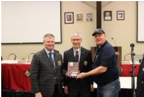
Faith In Action Family Award Council 1634 Hillsboro