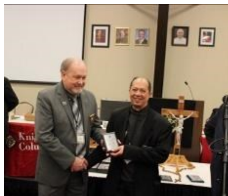
Community Activity Award Division 1 Honorable Mention Council 9257 Milwaukie