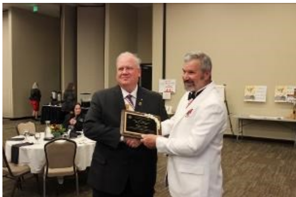
Bud Steinbacher Award