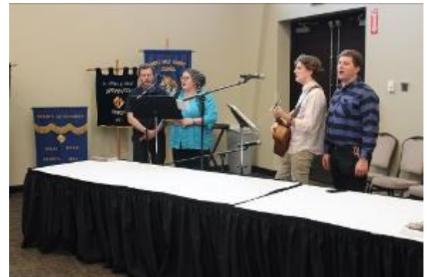
Choir for all our Masses. Excellent job by all of them