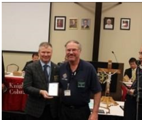
Family Activity Award Division 2 Council 3509 Molalla