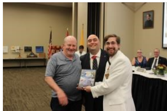
Patriotic Star Assembly Award Assembly 3219 (For 2020-2021)