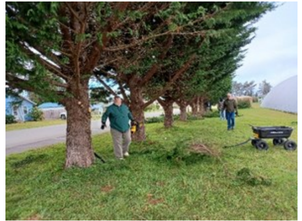
Knights with chainsaws – could be a dangerous mix—but it wasn't! Cleaning up the area around the Bandon School District baseball field