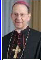
Archbishop William Lori