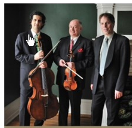
The Tempest Trio