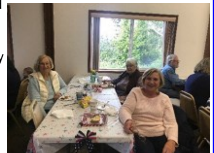
Some pictures from the Bandon Council installation: Ladies from the Altar society who helped with the set up and side dishes.

Most Holy Trinity Council 17396 in Bandon stayed active as well. They cut, delivered, and stacked 2 quarts of wood for an elderly widow in the parish. They donated $2,700.00 for a bronze plaque with the bible verse which explains—the woman at the well—statute in the parish picnic area. They had a well-attended installation of Officers with several family members attending. Although their Chaplain was out of town, he sent a very inspirational message to the District Deputy to be read at the installation. This was followed by a great array of food.