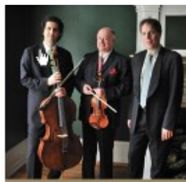
The Tempest Trio