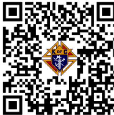
SPANISH QR CODE