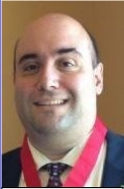
Duane Morris Oregon District Master