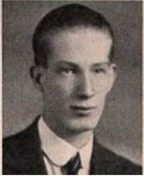
1929 Washington High