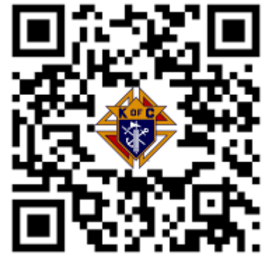
ENGLISH QR CODE