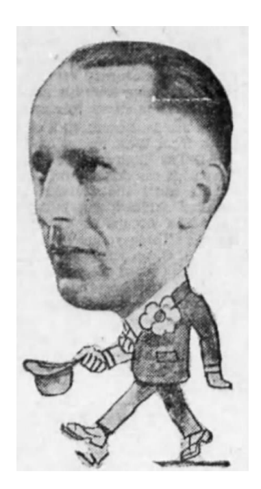
Thomas from a 1929 newspaper